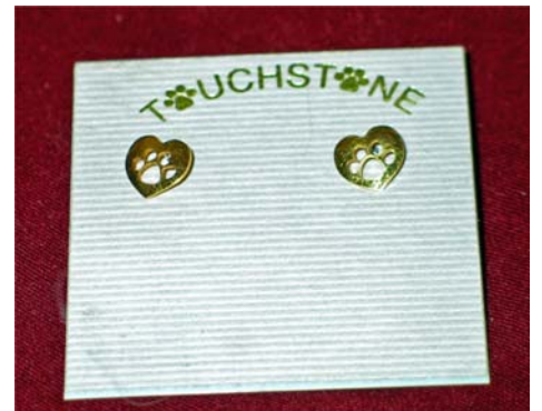
Gold Earrings (pierced) donated by Pomkees