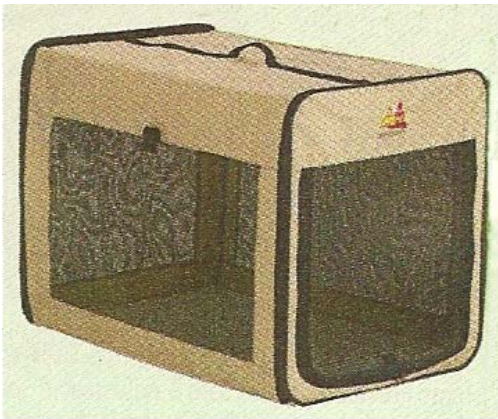
Soft Sided Crate donated by Treasure Coast