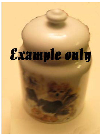
Painted Cookie Jar created and donated by